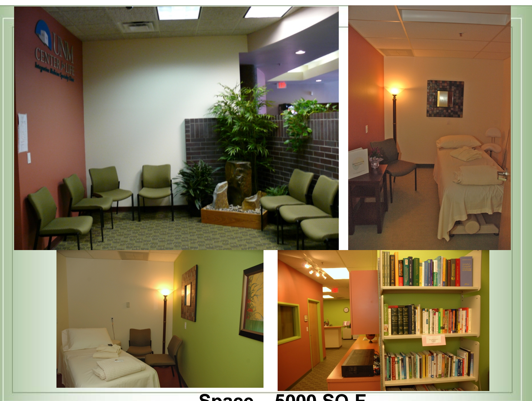
Space – 5000 SQ.F